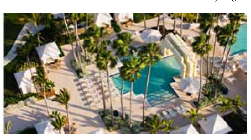
Relax at the three pool waterfall oasis including a bubbling hydrotherapy pool