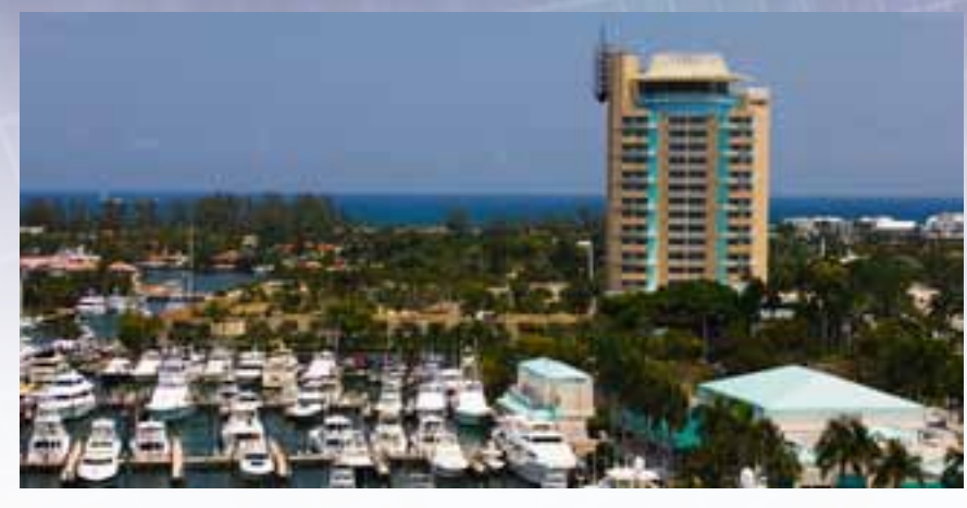
Pier Sixty-Six easy accessible state-of-the-art marina – the Aquatic Centre

W.A.D. World Networking Reception - Adding on to this world-class venue is our first W.A.D. World Networking Reception, an opportunity to mingle and convert your networking to business referrals. This is the perfect opportunity to catch up with old acquaintances, meet new colleagues, and network with peers and industry professionals, members as well as non-members. Promote and build