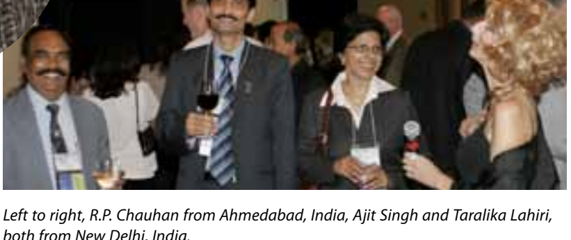
both from New Delhi, India.