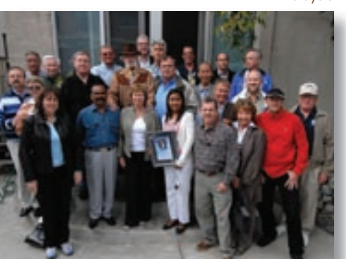
The WAD Family