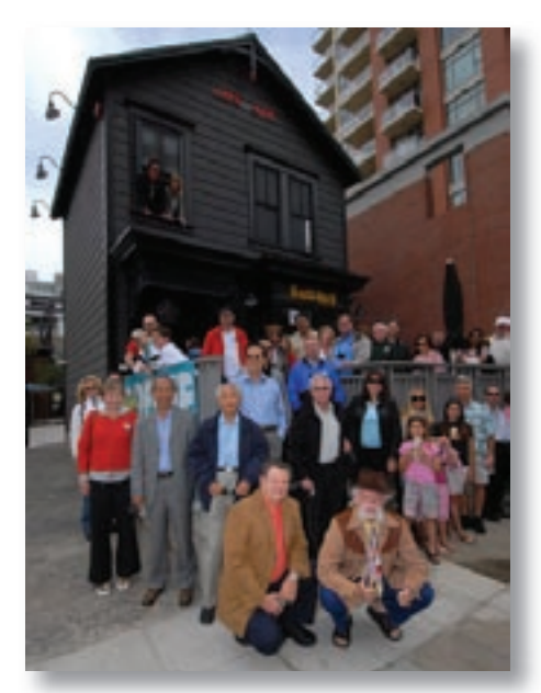
The WAD family in front of the PI Museum