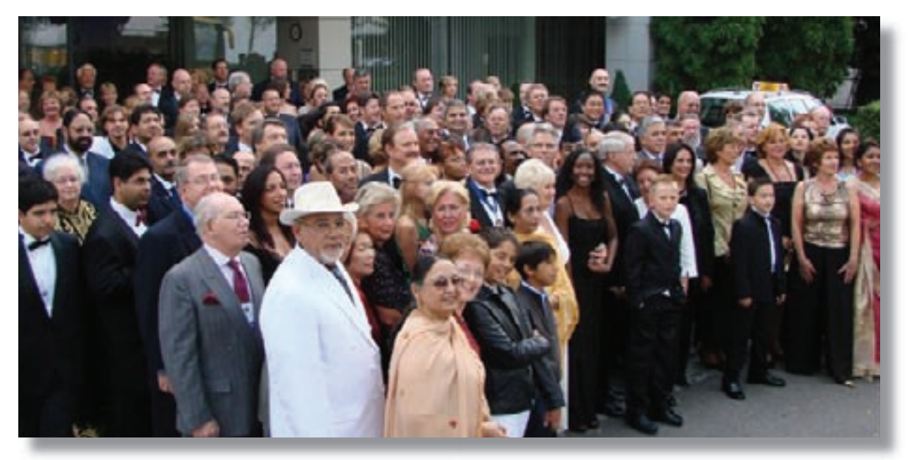
Group picture before the 82<sup>nd</sup> Annual Gala Banquet