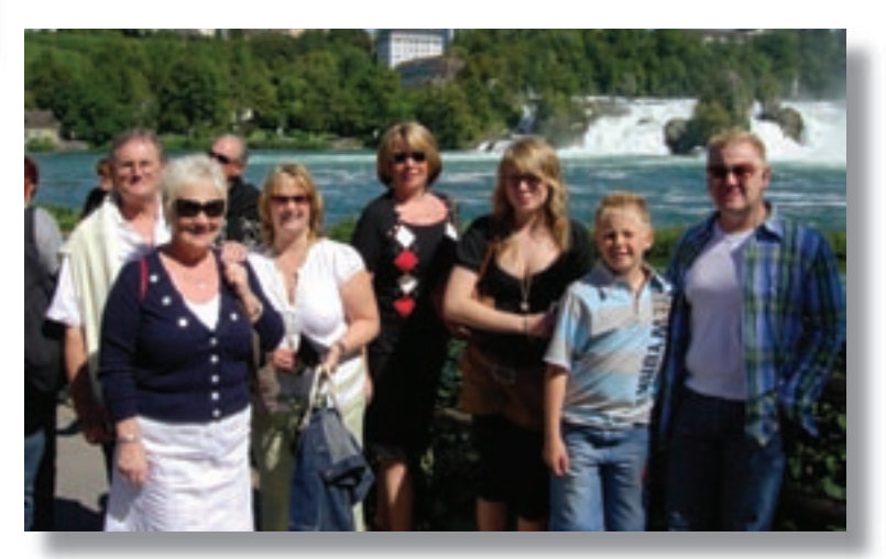
The Shelmerdine family at the waterfalls